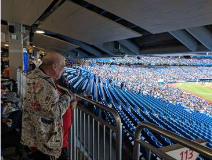
Blue Jays Baseball Game!