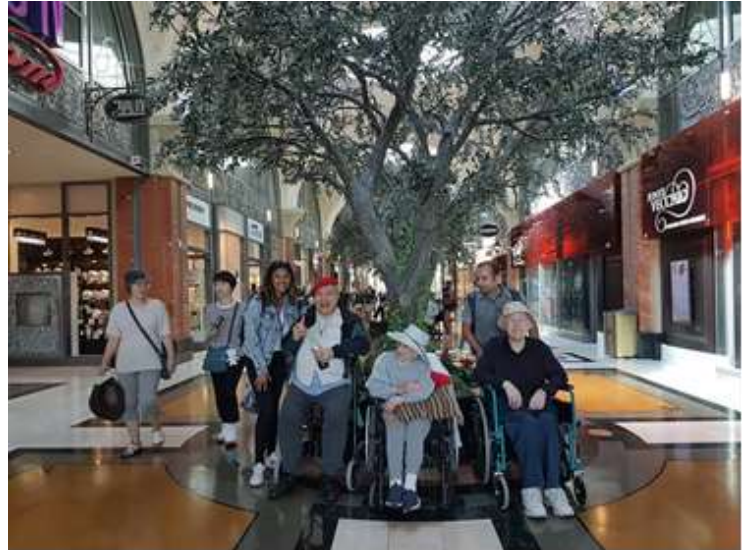
Niagara Fallsview Casino Trip!