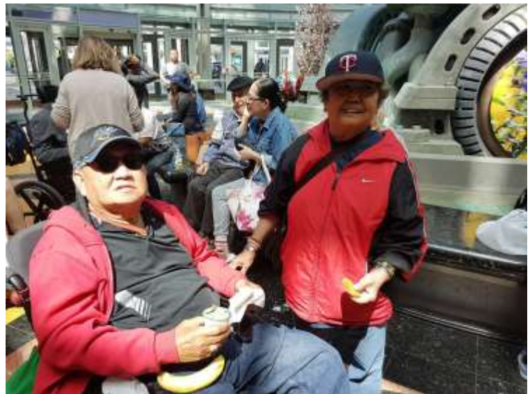
Niagara Fallsview Casino Trip!