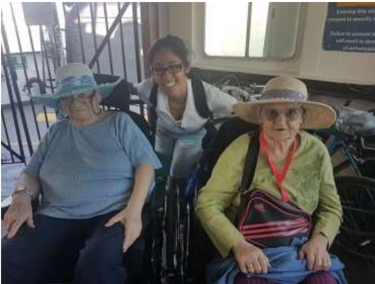
Ward's Island: Sunshine Center!